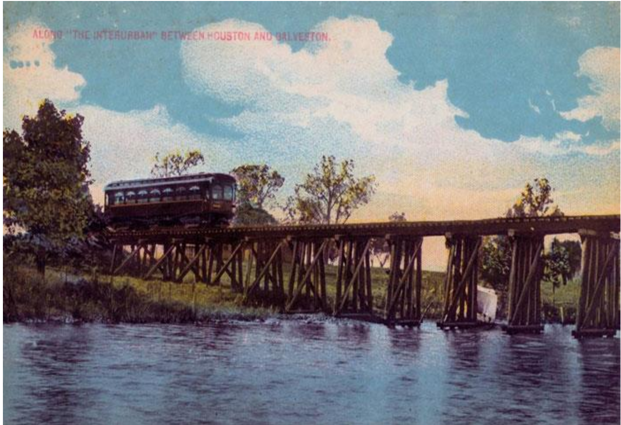
The Galveston-Houston interurban streetcar began service December 5, 1911. It lasted until 1936, when it was replaced by buses.