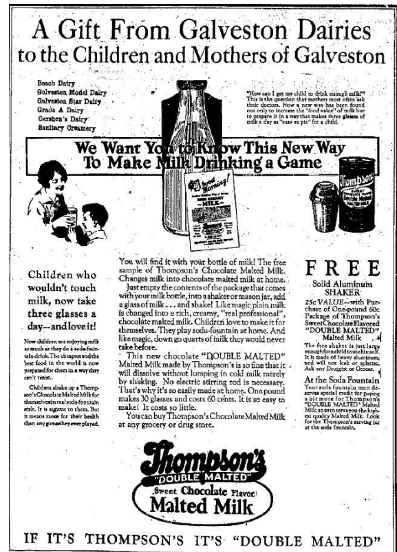
Galveston Daily News advertisement Nov. 1, 1927.

During its early years, Galveston Star Dairy utilized various avenues to advertise its products and seek customers. Along with other local businesses, the firm sponsored free cooking lessons held by the News-Tribune Free Cooking School in 1931.