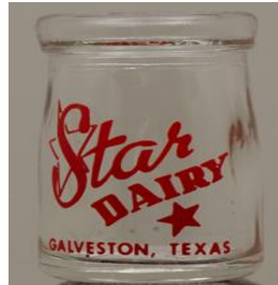
Galveston Star Dairy milk bottle Rosenberg Library Museum collection

Older Galvestonians will recall a simpler time when the milkman made his early morning rounds, delivering whole milk in glass bottles to the doors of residences. Dairies decades ago advertised wholesome products and cleanliness. In order to operate, they required a supply of milk (provided by dairy cattle on Galveston Island and the Mainland of Galveston County), and the means to sterilize, bottle, and deliver milk by trucks.