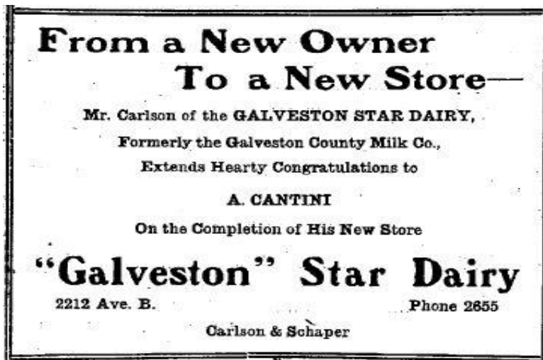
Star Dairy Galveston Daily News advertisement May 5, 1927

An association was organized in August 1906 to promote the interests of Galveston County dairy farmers and dairymen, as well as to coordinate with health inspectors. Local dairies took great pride in